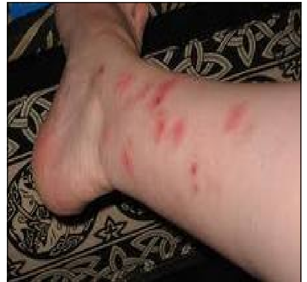
Bed bug bite welts on a leg, above, and on a torso, below.