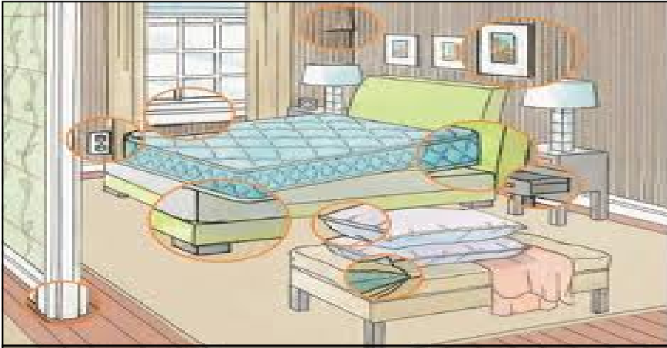
The circled areas in the diagram above shows some of the places to check for bed bugs.