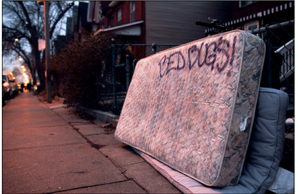
Clearly mark all items which are infested with bed bugs and put at the road as garbage. This will help to ensure that no one takes the items from the garbage and brings the bugs home with them.