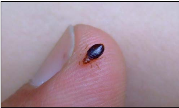
Above, the size of a bed bug compared to a thumb.

Bed bugs are oval, flat, reddish brown and about the size of an apple seed.