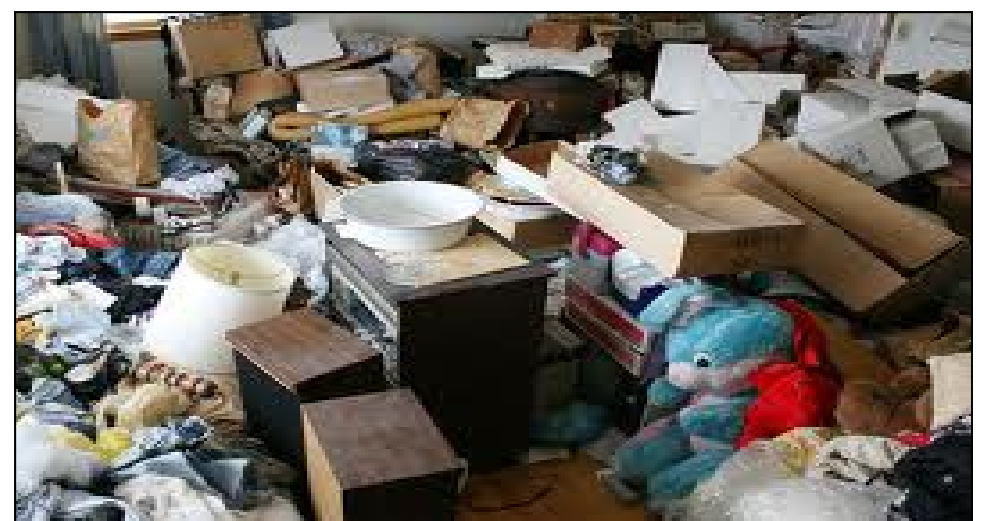
Bugs can easily hide in clutter. Keep apartments tidy and clean to avoid problems, and to facilitate early detection and treatment.

Bed bugs and other insects love clutter! Get rid of all items that you no longer need and keep a clean, sanitary apartment. If you do experience an infestation there will be less opportunity for the bedbugs to hide, and more chance that the treatment will work.