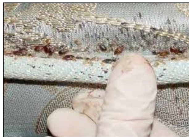
A mattress infested with bed bugs.

The first place to check is mattresses and bedding. Check for tiny blood stains or brownish stains on sheets, pillow cases, blankets and mattress. The brownish stains are fecal matter (poop), the red is the blood. The bugs may also be visible. If small white objects are found they may be bed bug eggs.